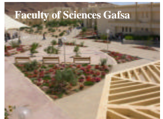
Faculty of Sciences Gafsa